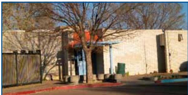
In 1973 the City got a Community Development Block Grant to construct the building at 1121 Alto St. La Familia had only about 30% of the space with the other 70% devoted to the City daycare center.

Pictured below are the various locations of La Familia Medical Center past and present, the Health Care for the Homeless site and the new dental clinic. Special anniversaries and milestones such as our 40th year are inspirational because they remind everyone involved with how very far this community health center has come and how many people have come through these doors.