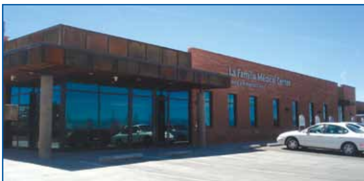
In 2011, a new dental clinic was opened on the campus of the Santa Fe Community College. The building was constructed with a bond issue and the clinic was equipped with federal stimulus funds.