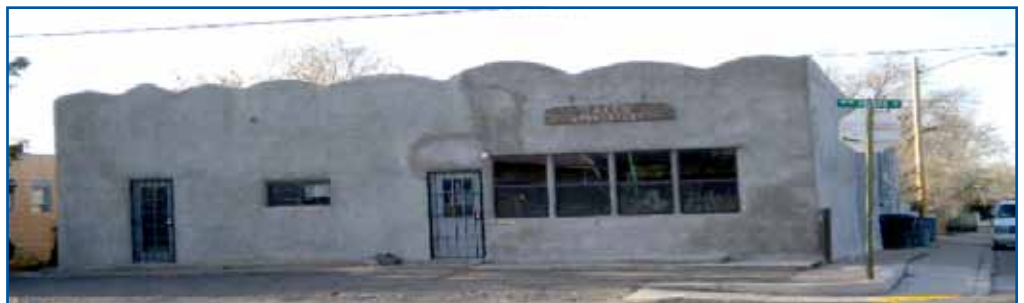
This small clinic was funded by the Model Cities program which was a part of Lyndon Johnson's 1960s "War on Poverty". One current La Familia employee recalls going there as a patient and being given a used housecoat for a patient robe. No wonder some folks refer to that site as the "hippy clinic".

La Familia's first "real" home was at 1121 Alto St. which was built with Community Development Block Grant funds obtained by the City of Santa Fe. The building housed a City-run daycare center and La Familia. Operational funding came from several sources including the City of Santa Fe, NM Dept. of Health, the United Way, St. Anne's Parish and the Episcopal Church of the Holy Faith. When the daycare center closed in 1984, La Familia took over their space. But by 1987, it was clear the expanded space wasn't sufficient to meet the growing need. Another CDBG grant funded improvements to the building and for the first time, LFMC secured federal funding for operations when La Clinica de la Gente, located in the Village of Agua Fria, decided to give up their federal funding and become a private clinic. Another block grant and Capital Improvement Program grant paid for the improvements.