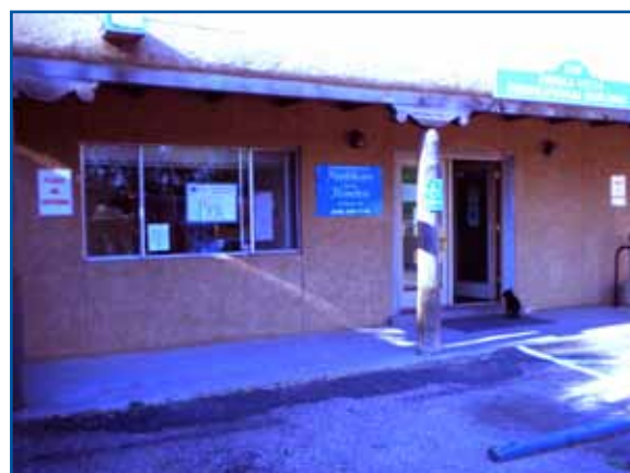
In 2002, LFMC opened a drop-in clinic on Camino Sierra Vista to serve the homeless population of Santa Fe. Since that time an average of 1,000 adults and teens have been served at Health Care for the Homeless annually. Federal, state, city and private funding support the operation of the facility.