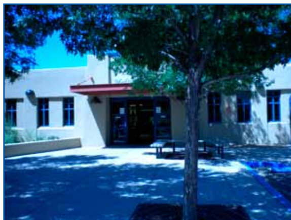
The current home of La Familia's largest site was built in 1995 as part of a major civic improvement project that included the construction of the Senior Center. The new space tripled the size of the previous site. Once again, funding came from a variety of sources including the Federal Government, State of New Mexico and City of Santa Fe. The McCune Foundation made a very large grant to equip the new clinic. The City retains ownership of the building.