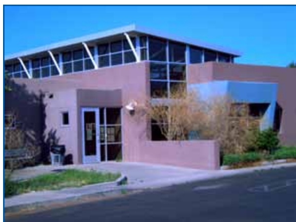
Almost as soon as the Alto St. site was completed, the need for a facility on the south side of the city became apparent. The building on Caja del Oro Grant Road was completed in 2000. The County supports the clinic by underwriting the rental cost.