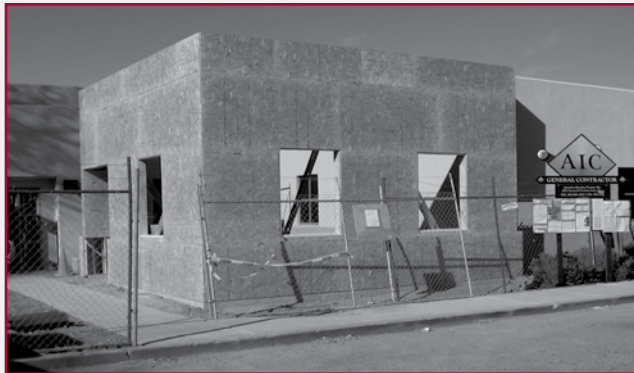
Changes at Alto